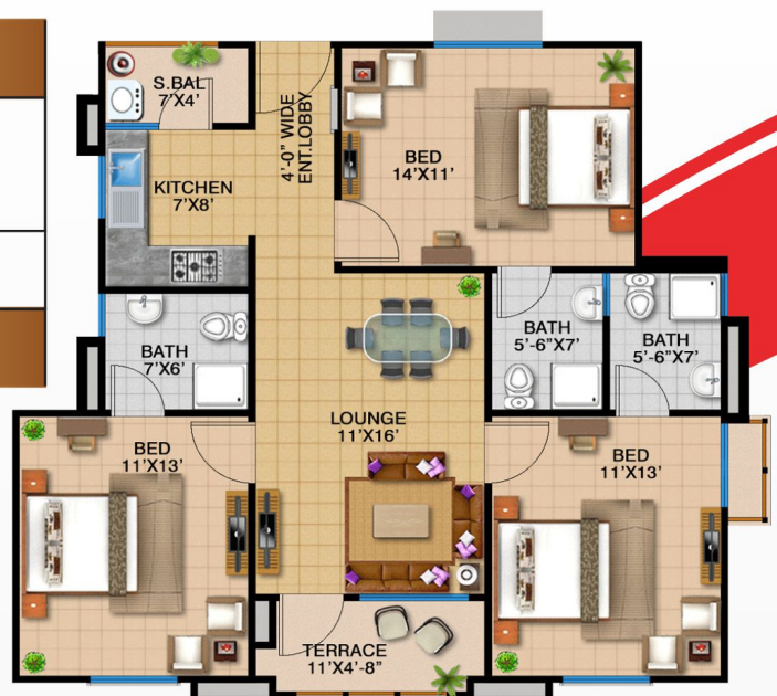
3 BED, LOUNGE