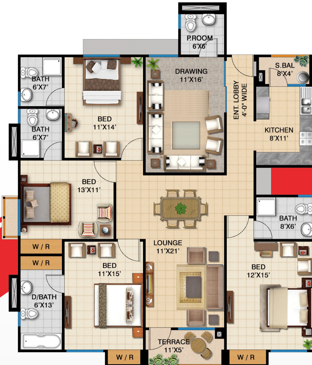
4 BED, DRAWING & DINING