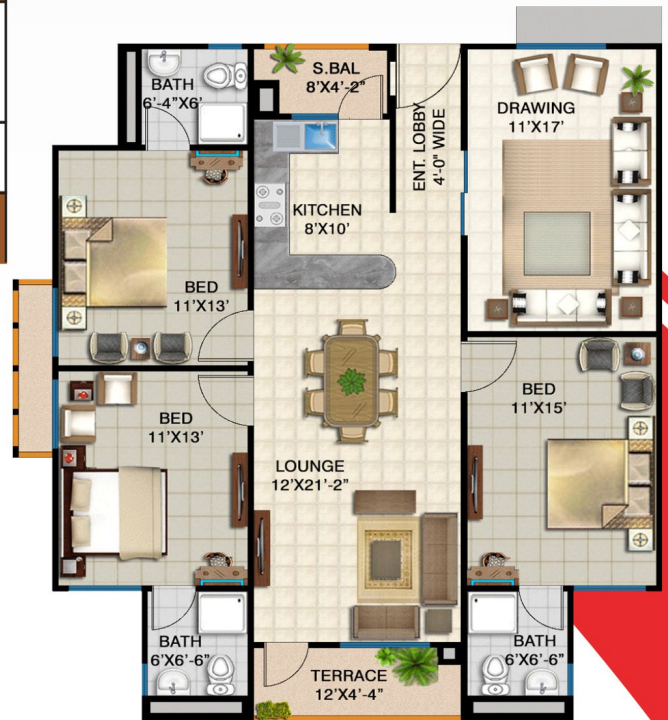
3 BED, DRAWING & DINING