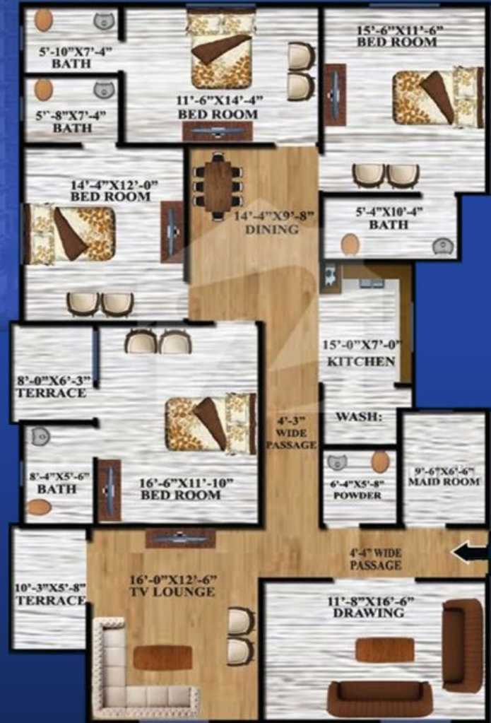
PLATINIUM LAYOUT PLAN