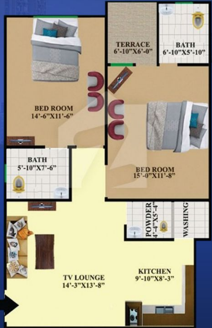
BRONZE LAYOUT PLAN