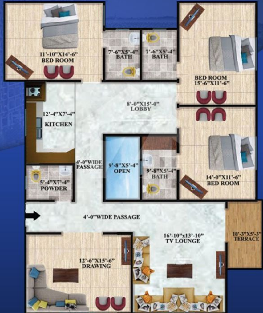
GOLDEN LAYOUT PLAN