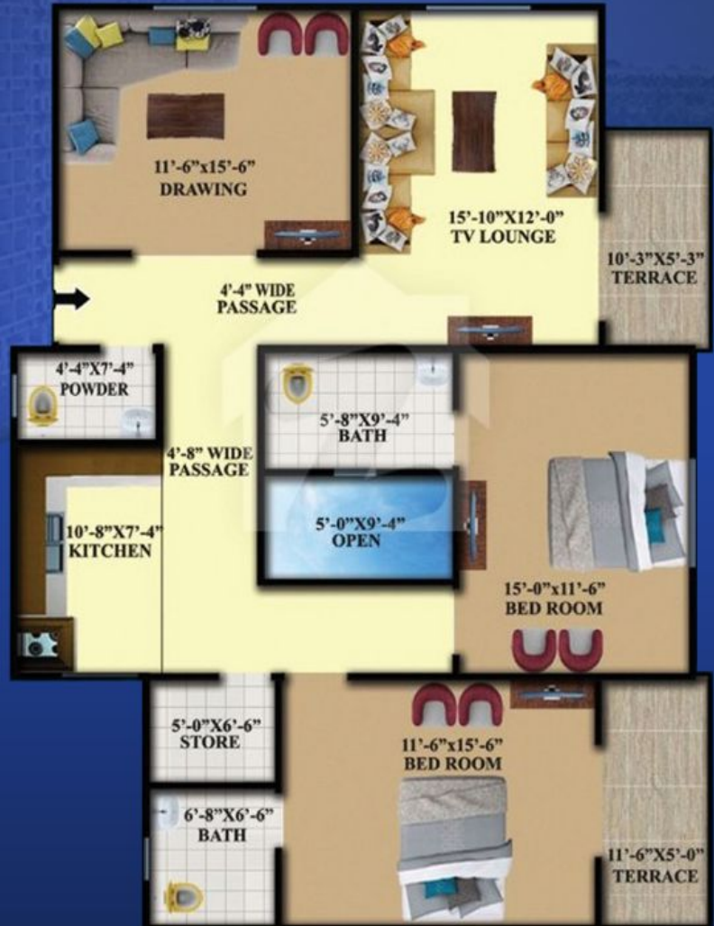
SILVER LAYOUT PLAN